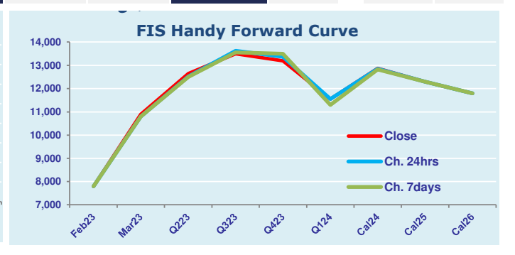
Spot Price