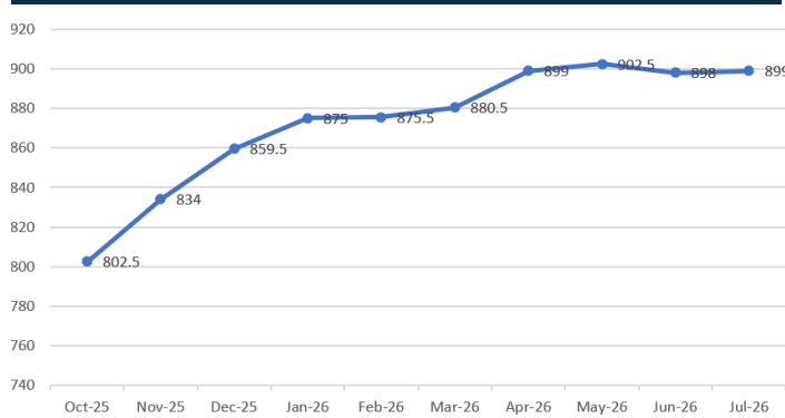
CME US HRC INDIC