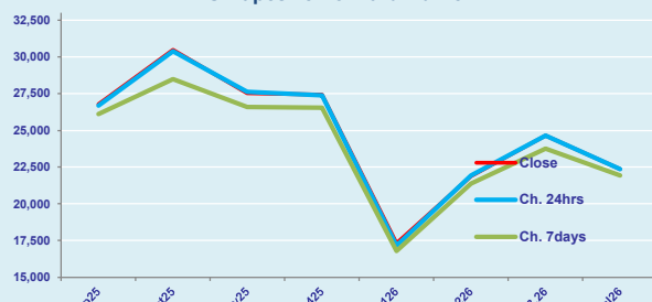
FIS Capesize Forward Curve