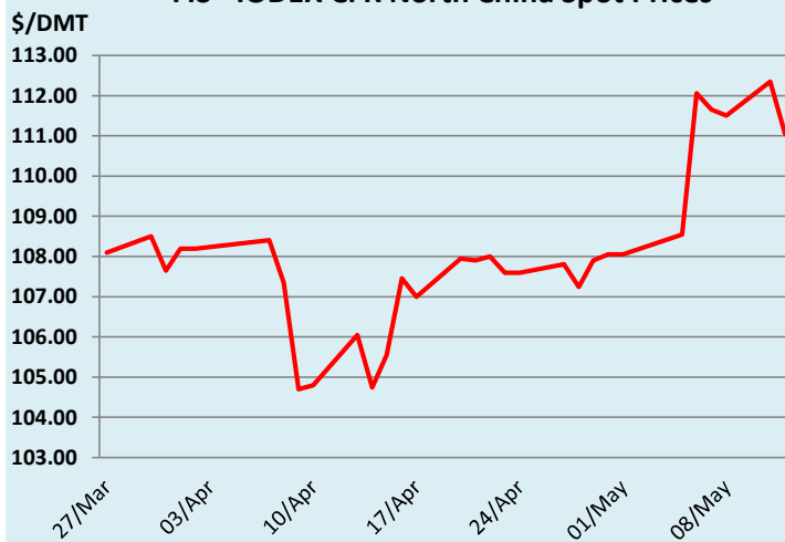
FIS - IODEX CFR North China Spot Prices

Last week, total shipments from Brazil and Australia fell to 22.92 million tonnes, down 4.6 million tonnes w/w. Meanwhile, iron ore arrivals at 45 Chinese ports reached 22.88 million tonnes, a decline of 2.07 million tonnes, while arrivals at six northern ports dropped by 2.22 million tonnes to 10.64 million tonnes.