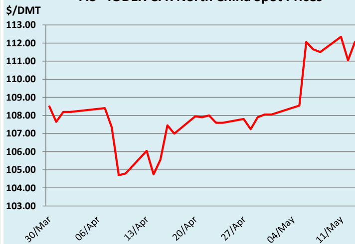
FIS - IODEX CFR North China Spot Prices

The Port of Dampier, Australia, will temporarily close the east and west berths at Dampier Cargo Wharf from May 18–24, 2026, for maintenance and deck repairs. All shipping operations will be suspended during this period, potentially impacting iron ore shipments.