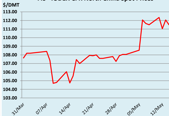
FIS - IODEX CFR North China Spot Prices

The iron ore market remained range-bound with active primary trading. BHP sold one cargo each of NHGF and JMBF, while Vale concluded a BRBF cargo at $116.60/dmt and also sold one High Silica Carajas cargo (60.77% Fe).