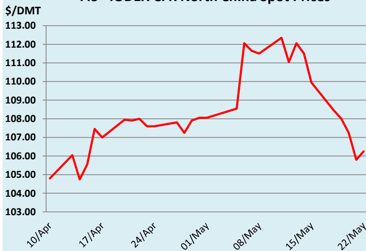
FIS - IODEX CFR North China Spot Prices

Blast furnace activity improved week on week, with the operating rate rising to 84.14% (+0.62% w/w, +0.45% y/y) and utilization reaching 90.28% (+0.56% w/w, -0.87% y/y). Average daily hot metal output increased to 2.41 million tonnes (+14.8kt w/w), though it remained 27.9kt lower than last year.