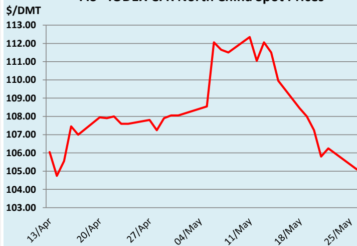
FIS - IODEX CFR North China Spot Prices

Over the past week, combined deliveries from Brazil and Australia rose to 31.33 million tonnes, up 5.60 million tonnes w/w. In contrast, iron ore arrivals at 45 Chinese ports fell to 24.22 million tonnes, down 2.77 million tonnes, while inflows at six major northern ports also decreased by 0.39 million tonnes to 12.78 million tonnes.