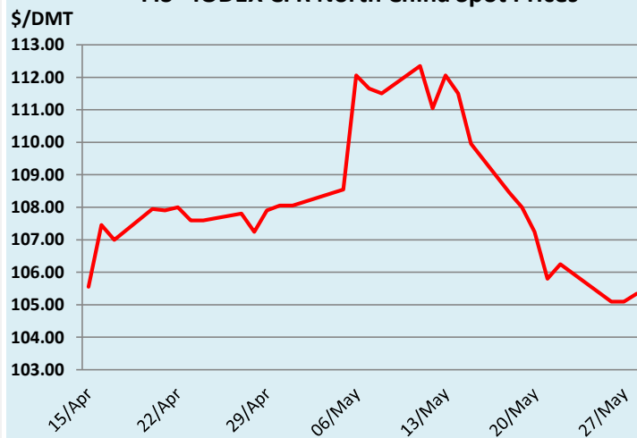
FIS - IODEX CFR North China Spot Prices

Iron ore shipments from Australia, including Port Hedland, rose to 7.2 million tonnes in the week ending May 15, 2026, compared with 5.9 million tonnes in the previous week.