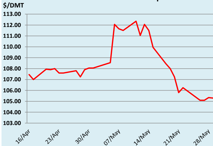
FIS - IODEX CFR North China Spot Prices

Imported iron ore inventories at China's 45 ports edged down slightly by 0.05 million tonnes to 163.96 million tonnes last week, while average daily port evacuations also declined marginally by 24,100 tonnes to 3.22 million tonnes.