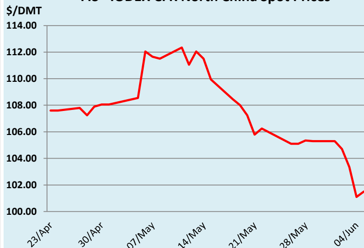
FIS - IODEX CFR North China Spot Prices

Mysteel reported that inventories of imported iron ore at China's 45 ports rose by 0.85 million tons w/w to 164.81 million tons. Meanwhile, the average daily drawdown declined slightly by 6,500 tons to 3.22 million tons.