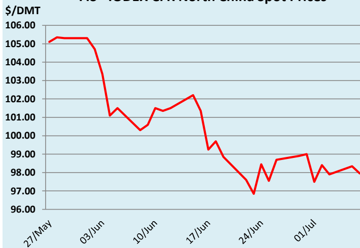
FIS - IODEX CFR North China Spot Prices

During the past week, combined iron ore deliveries from Brazil and Australia increased by 0.37 million tons w/w to 28.31 million tons. Meanwhile, iron ore arrivals at China's 45 major ports declined by 2.26 million tons to 25.12 million tons, while arrivals at six northern ports rose by 1.07 million tons to 13.12 million tons.